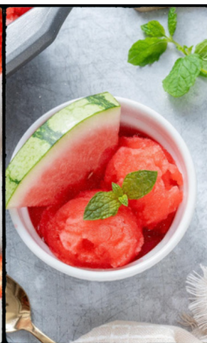
Sicilian Watermelon sorbet 2.5lt