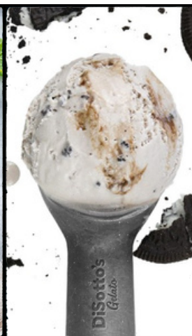
Vegan Cookies & Cream 2.5lt